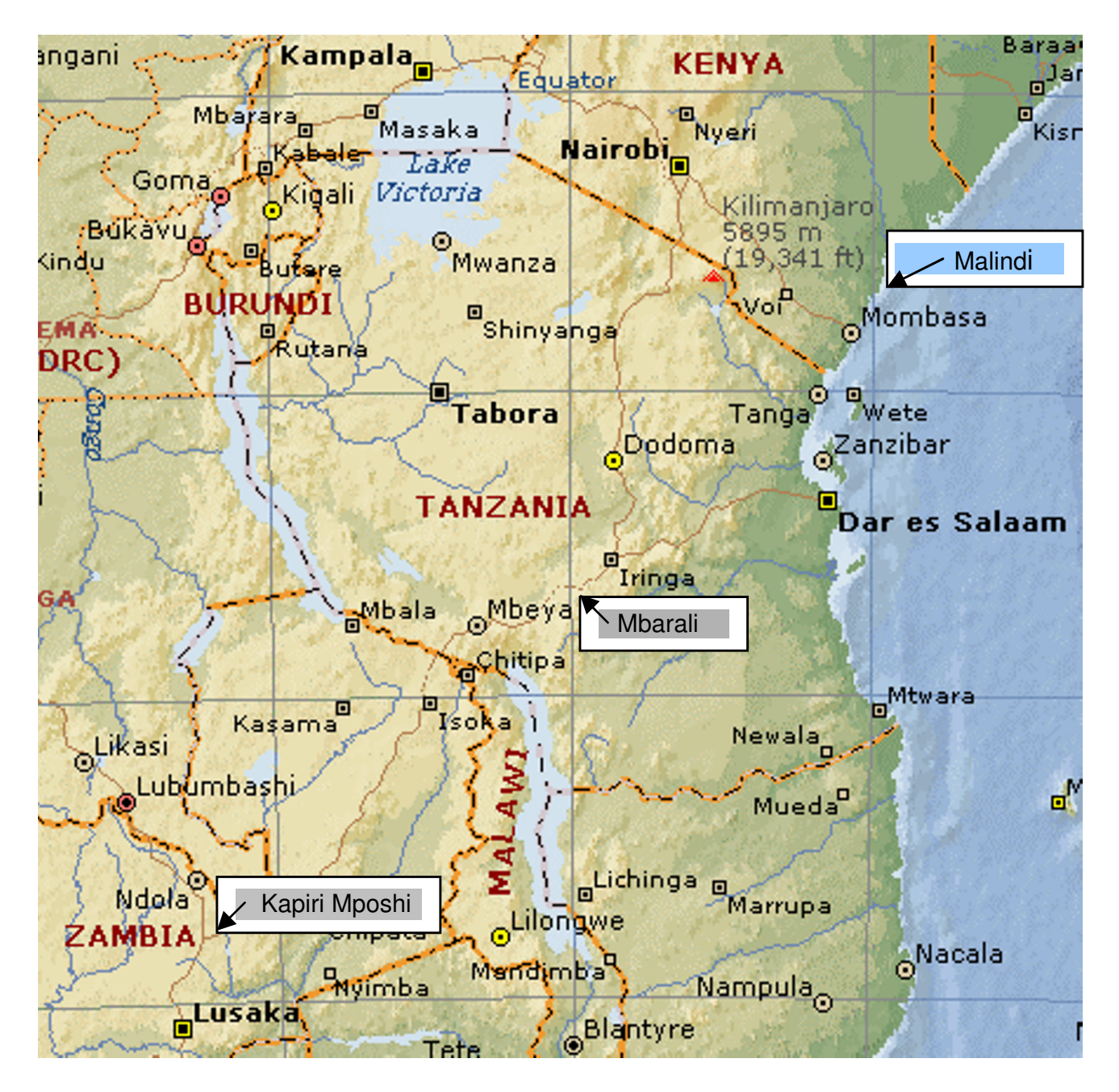
Figure 3 District locations.

The project applies AFR through a participatory and interdisciplinary action research design. Each study district represents a case, in which decision-making is studied from