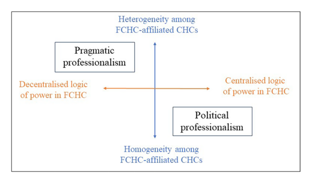
Fig. 3 Contours of professional segments called "political professionalism" and "pragmatic professionalism". On the orange axis: the position relative to the organization of the FCHC; on the blue axis: the position relative to the degree of variety considered desirable within the FCHC

The professionals we have associated with the political professionalism segment have at the core of their professional commitment an ideology based on a societal transformation project. That ideology is manifested through activism, philosophy and the organization