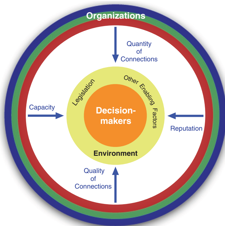
Figure 2 The four dimensions of embeddedness.

organizations and what they produce (like in the case of Mexico). Other enabling factors specific to the policy environment include historical precedence of relying on evidence to inform policy (path-dependency), research background of decision-makers, an active civil society, a forum for consistently placing decision-makers in contact with evidence generators, well-established modes of communicating clearly between actors (policy-briefs, updates, emails, digestible reports, etc.), responsive channels for quickly sourcing evidence, and access to centrally-located HPSR generated by embedded organizations, but shared by all actors [21]. Thus, the environment is an important mediator, either hindering or facilitating the uptake of HPSR by decision-makers.