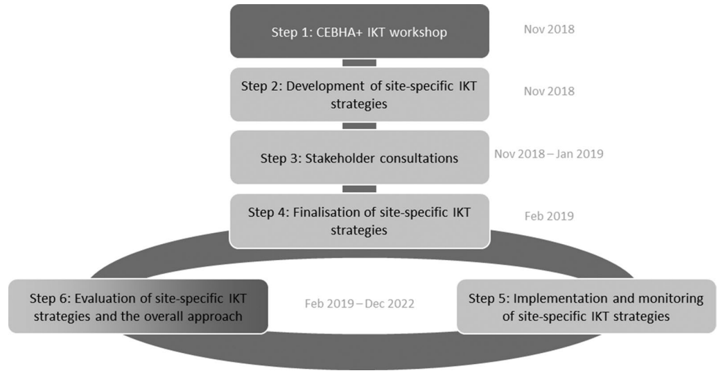
Fig. 1 CEBHA + IKT approach [34]

This CEBHA+IKT programme theory captured the intended intervention outcomes, implementation outcomes, intermediate outcomes as well as final outcomes: Intervention outcomes included relationship enhancement (improved mutual understanding and trust, changed attitudes towards research/policyand-practice), collaborative research (appreciation, diversity of partners, continuous engagement), and capacity-building (improved access to information and contacts, broadened perspective and skills, enhanced capacity for collaboration) [34]. We theorised that these would lead to long-term and continuous partnerships between researchers and decision-makers. Ultimately, these would result in the production of research that was more relevant for decision-makers and implemented more rapidly in policy and practice [3, 33]. The theory also captured contextual factors on the individual, organisational, project, and macro level. As such, it constituted an initial shared understanding of how the CEBHA+IKT approach was envisioned to work as well as making its goals explicit.