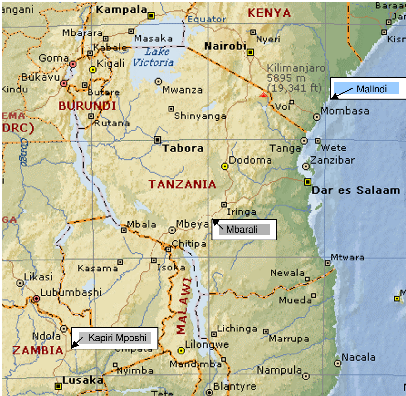
Figure 3 District locations.

The project applies AFR through a participatory and interdisciplinary action research design. Each study district represents a case, in which decision-making is studied from