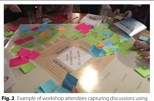
Fig. 2 Example of workshop attendees capturing discussions using the conversation template

The main workshop session followed a similar format to the YAG workshop. Tables were organized by thematic area, and each participant was involved in discussions for two thematic areas (of their choice and relevant to their experience), which lasted approximately 1 hour each. Each table discussion was led by a facilitator (typically a theme lead) and supported by a dedicated Post-it Note-taker, and an updated version of the YAG workshop conversation template was used to guide the discussion (see Fig. 1, right and Fig. 2). The template was divided into four sections with the following key questions: Knowledge—of innovative practices that are making a